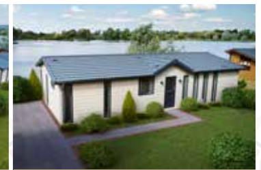
The Willow Lodge