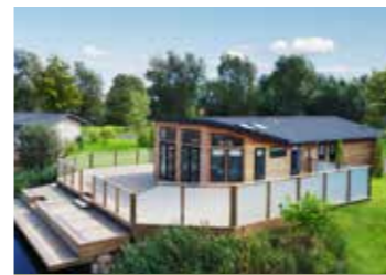
The Glass House

Langtoft Lakes offers unrivalled luxury lifestyle living combined with a private tranquillity rarely found in a lodge park. This is an exclusive development of just 37 lodges nestled on a 57 acre site with a further 400 acres on your doorstep to explore. Every lodge is situated on the lake's edge, guaranteeing breathtaking views all year round. Our lodges are built to the highest specification with furnishings, fixtures and fittings of the highest quality.