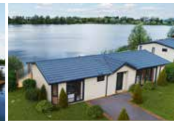
The Keepers Lodge