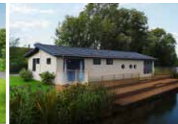
The Casa Di Lusso