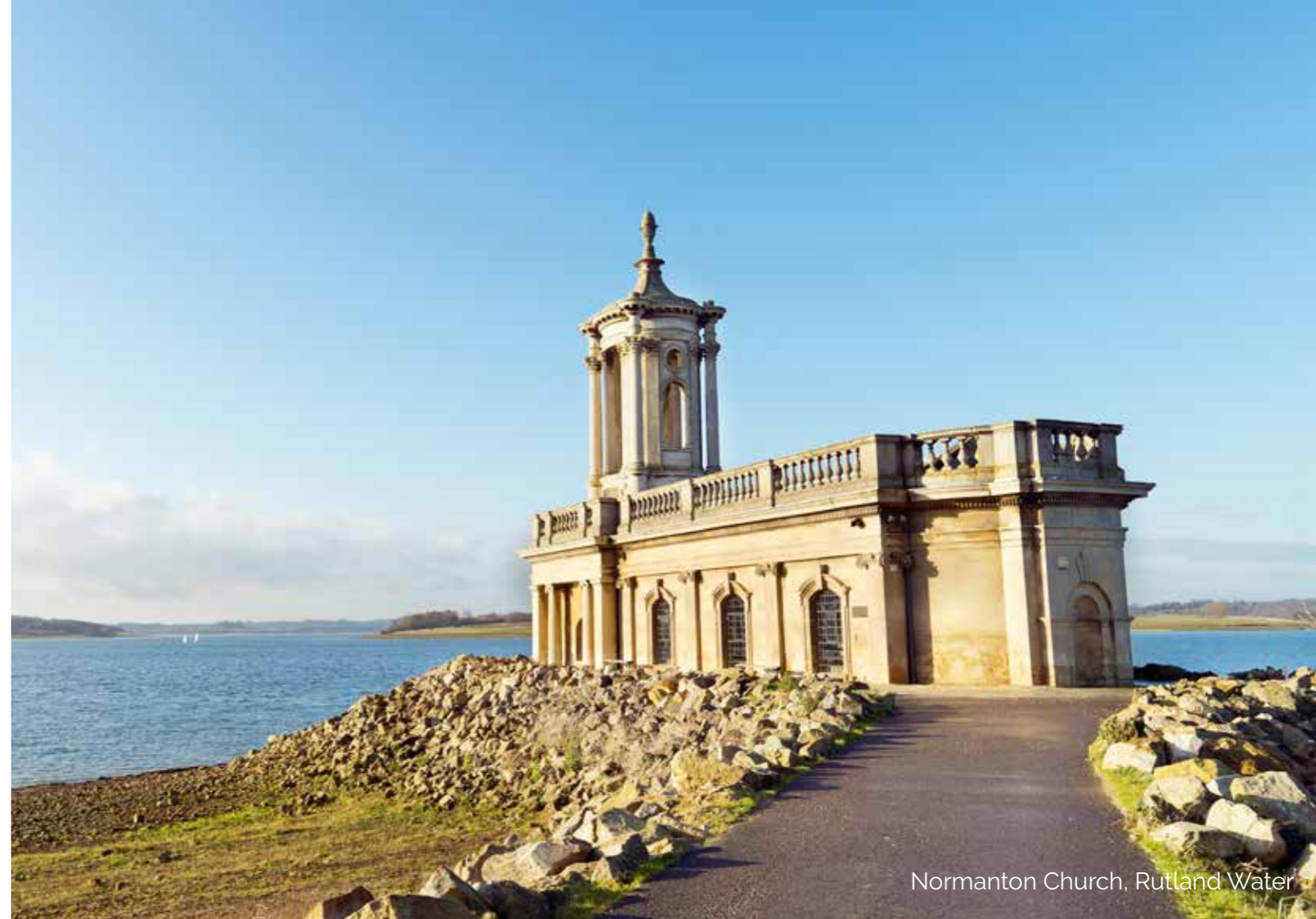
Normanton Church, Rutland Water

At its heart is Rutland Water one of the largest man-made lakes in Europe. Rutland Water is a great place for relaxation, recreation and conservation and has a range of activities, suitable for all ages, being run all year round. Rutland Water offers a multitude of leisure pursuits including water sports, cycling, fishing and bird watching.